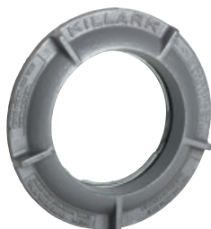
GL-375 Lens Cover