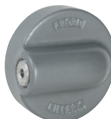
GECEY Sealing Cover