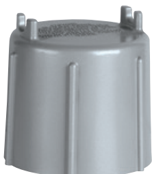
4GOU Dome Cover