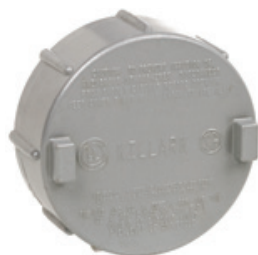
GECBC Blank Cover